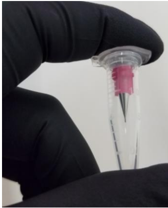
Image is a nozzle hub lodged inside lid of packing tube.

No damage occurs to a nozzle unless it is not dislodged prior to opening a packing tube.